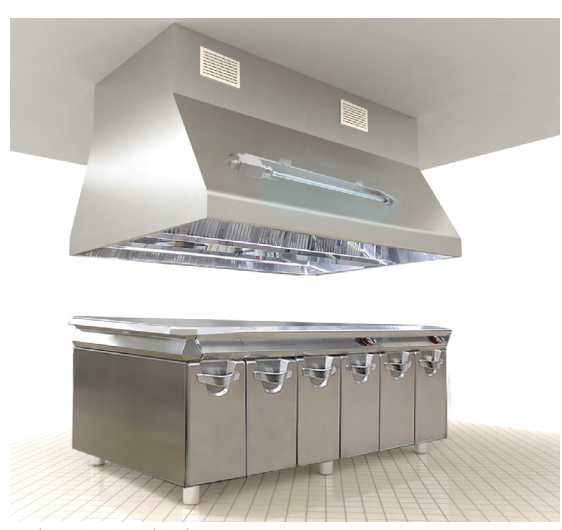
Application in a kitchen

UVGI technology is a physic disinfection method with a great costs/benefits ratio, it's ecological, and, unlike chemicals, it works against every microorganisms without creating any resistance.